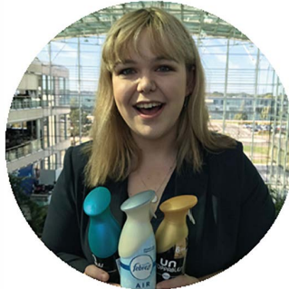
Alumnus of Robinson College