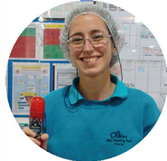
Alumnus of Pembroke College