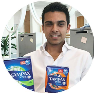
Alumnus of Emmanuel College