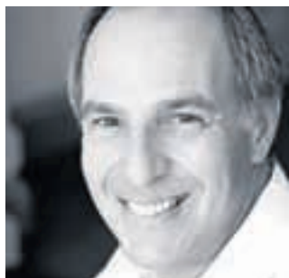
LOYD GROSSMAN Magdalene, Grad, History of Art

Who studies at a university like this? Loyd Grossman OBE, of course. Grossman has achieved celebrity status as the presenter of TV programmes Through the Key Hole and Masterchef . He is also a sauce magnate: Loyd's sauce business grosses over £50 million per year. Grossman has always supported charities related to museums in Britain and in 2007 was appointed Chairman of the Churches Conservation trust.