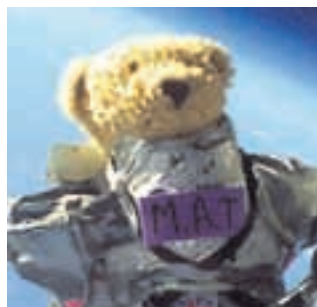
THE CAMBRIDGE SPACEFLIGHT TEAM Various, 2nd Year